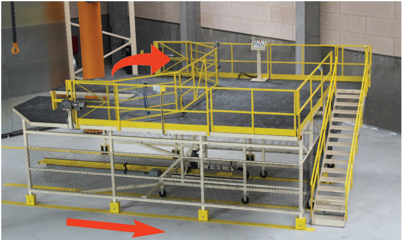
Shown above is the platform moved back from the arm with the roll-over safety fence indexed rearward.