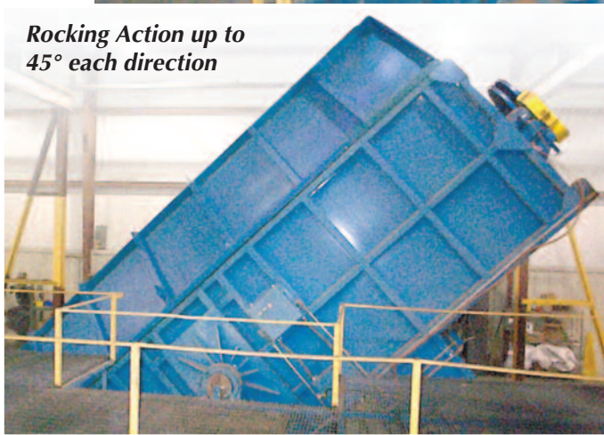
Rocking Action up to 45° each direction