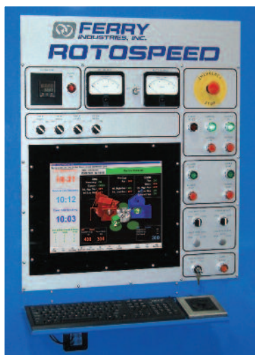
RotoCure™ Process Control Management

5 Standard sizes of Rocking Oven Machines available.