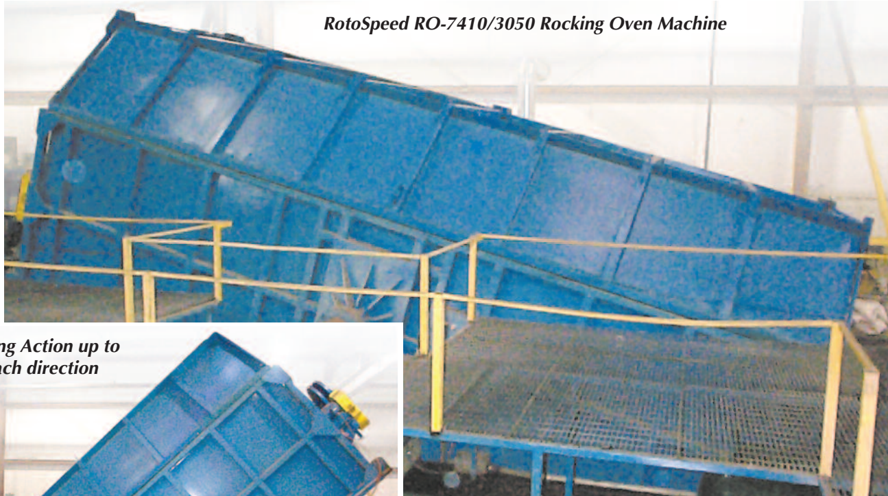
RotoSpeed RO-7410/3050 Rocking Oven Machine